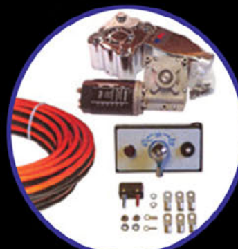
Bullet Proof Slim Motor Kit