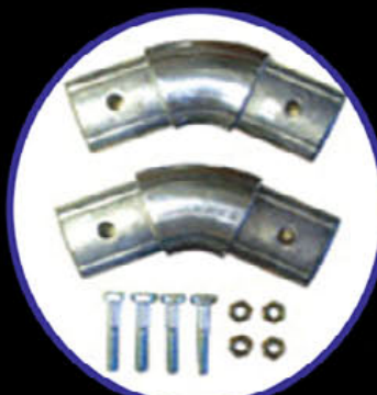
30° & 40° Elbow Kit