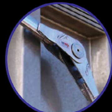
Knuckle Arm for Variable Hts

Life Time Warranty on our Bullet Aluminum Arms